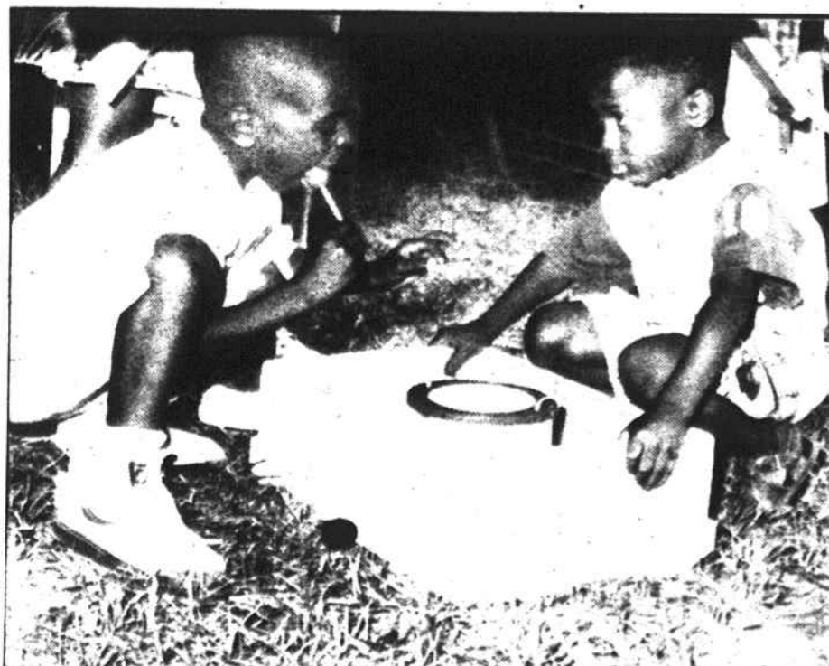
Two children in the Cleveland Avenue neighborhood look at a turtle.

Opening your bank statement shouldn't feel like opening a bill.