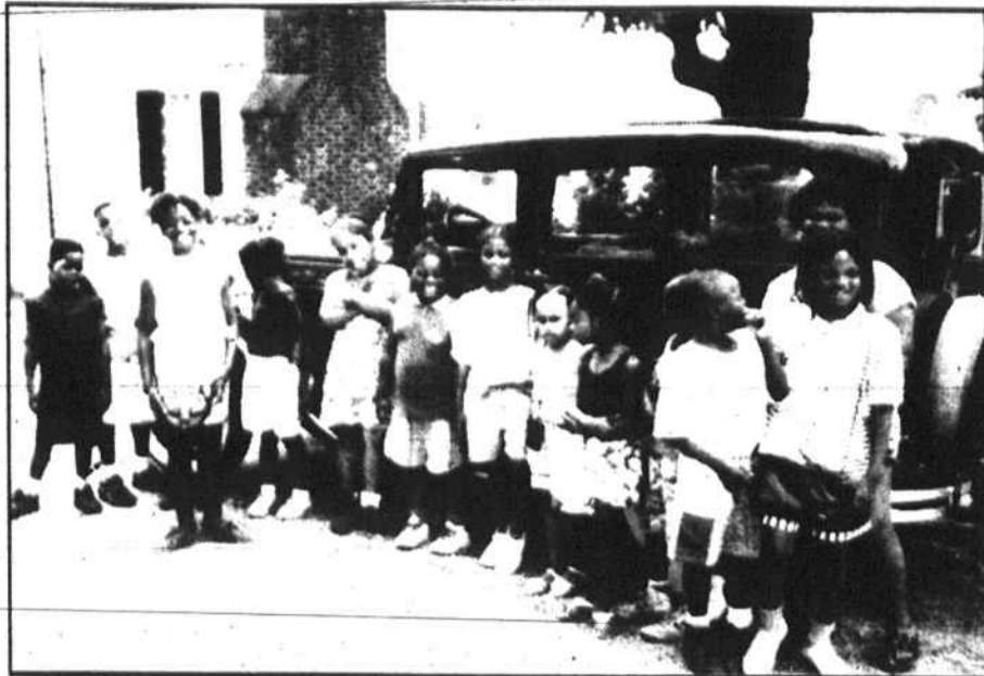
Kids from the MLK Recreation Center recently visited Old Salem.