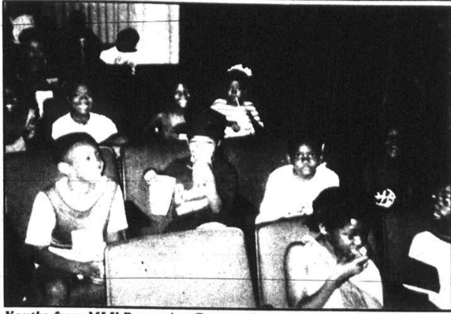
Youths from MLK Recreation Center take a trip to a local cinema.