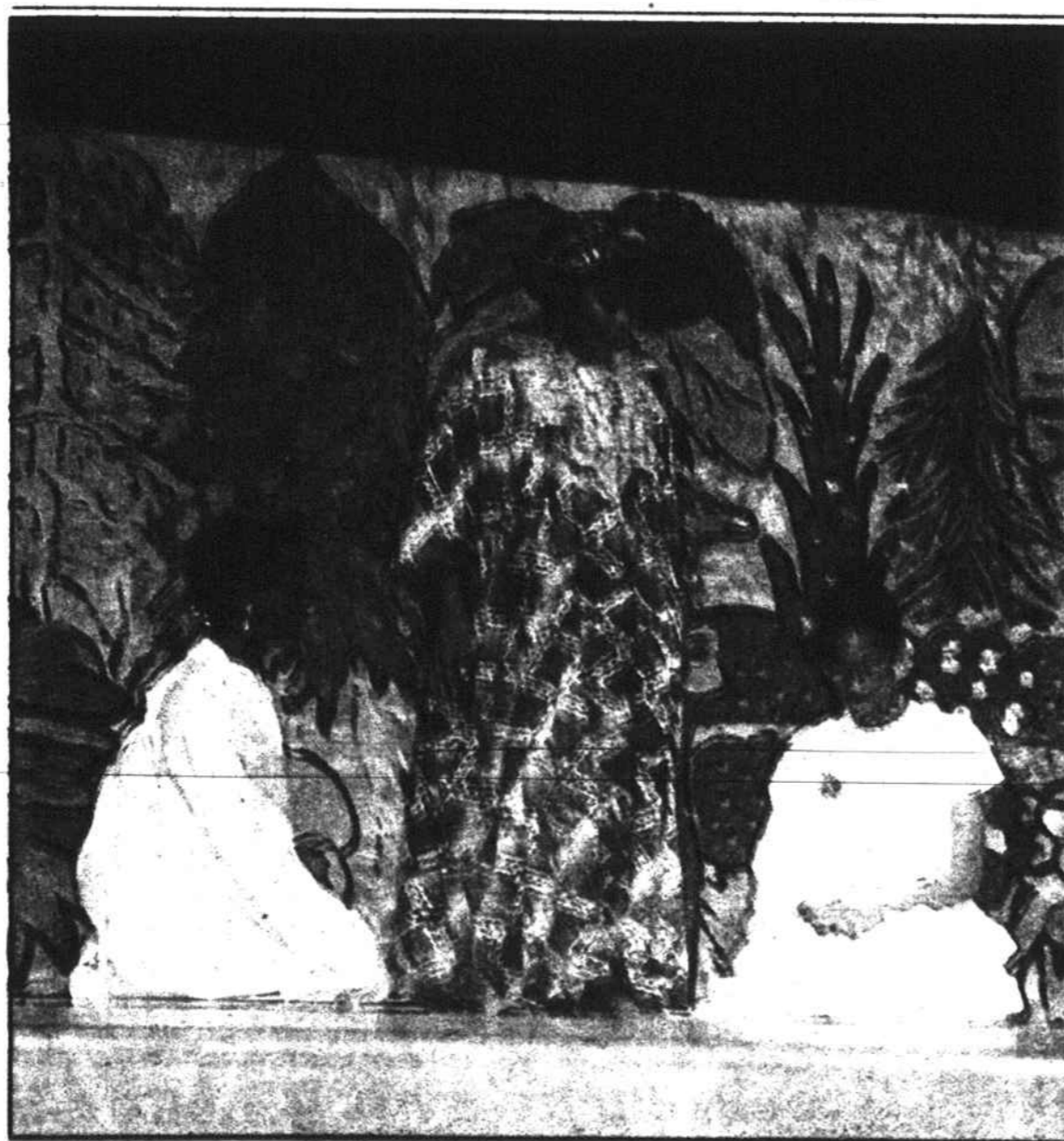
Mt. Tabor summer enrichment program students perform a play. (See story A4)