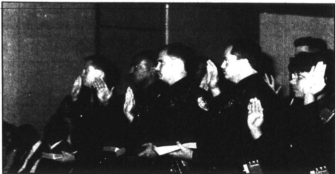
New police officers take the oath of office at Friday's graduation.