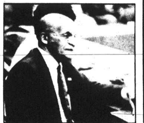
John B. McLendon Jr.

A host of honorees, including Clarence "Big House" Gaines