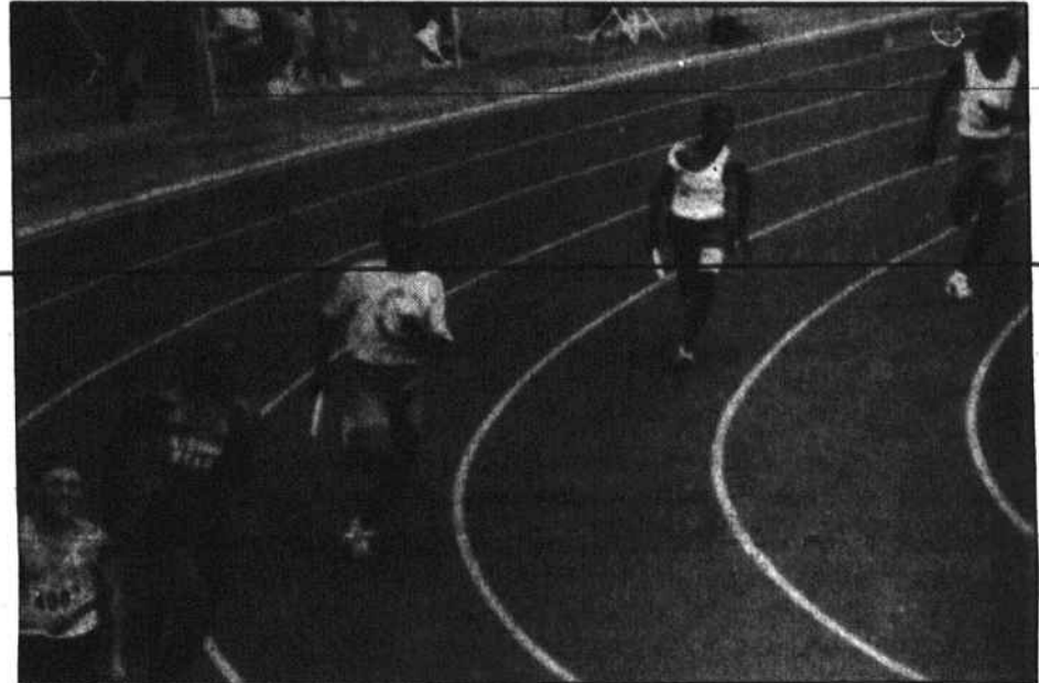
A team competes in the boys' 4 x 100 relay.