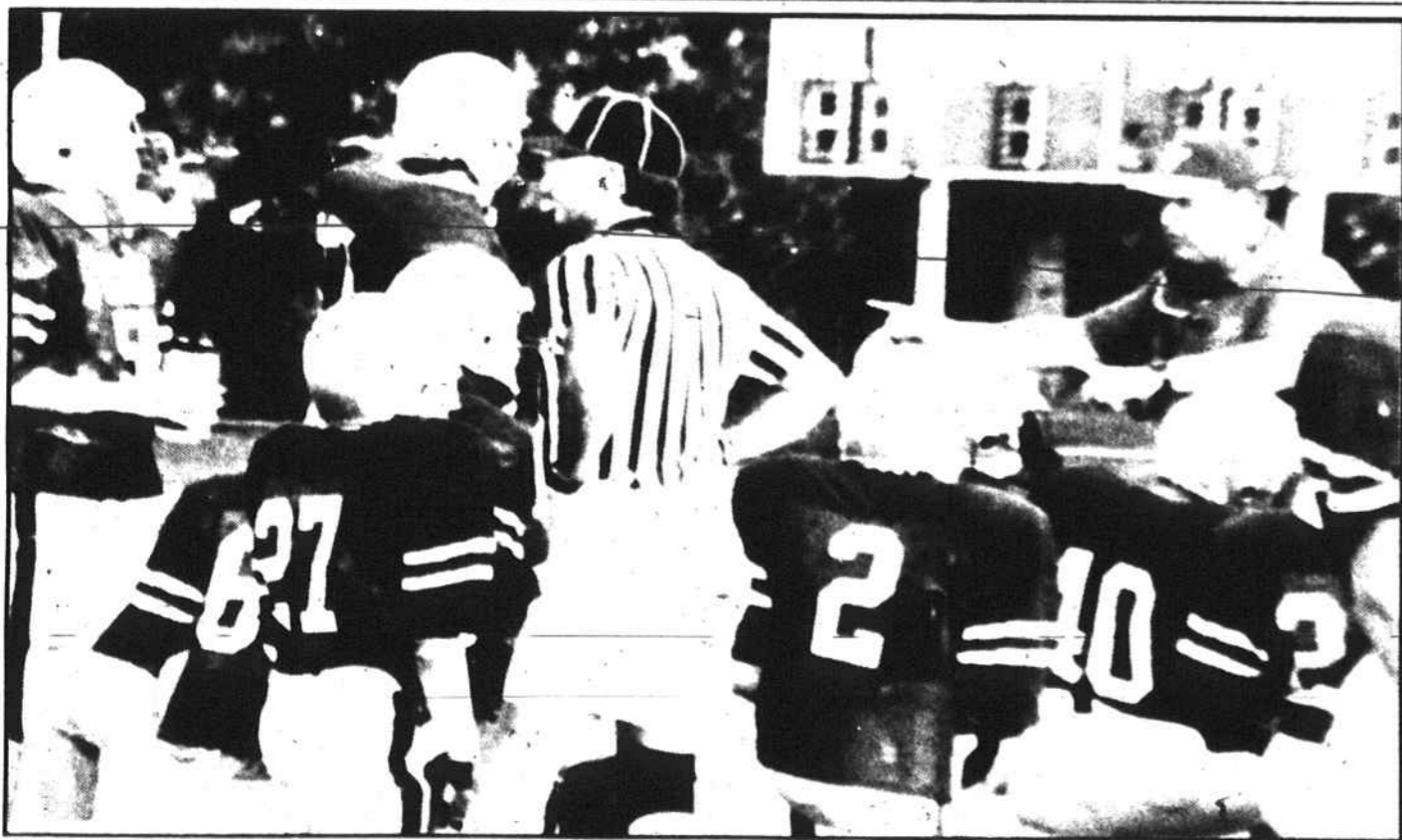
West Forsyth's junior varsity coaches give last minute pointers before the next quarter of play.