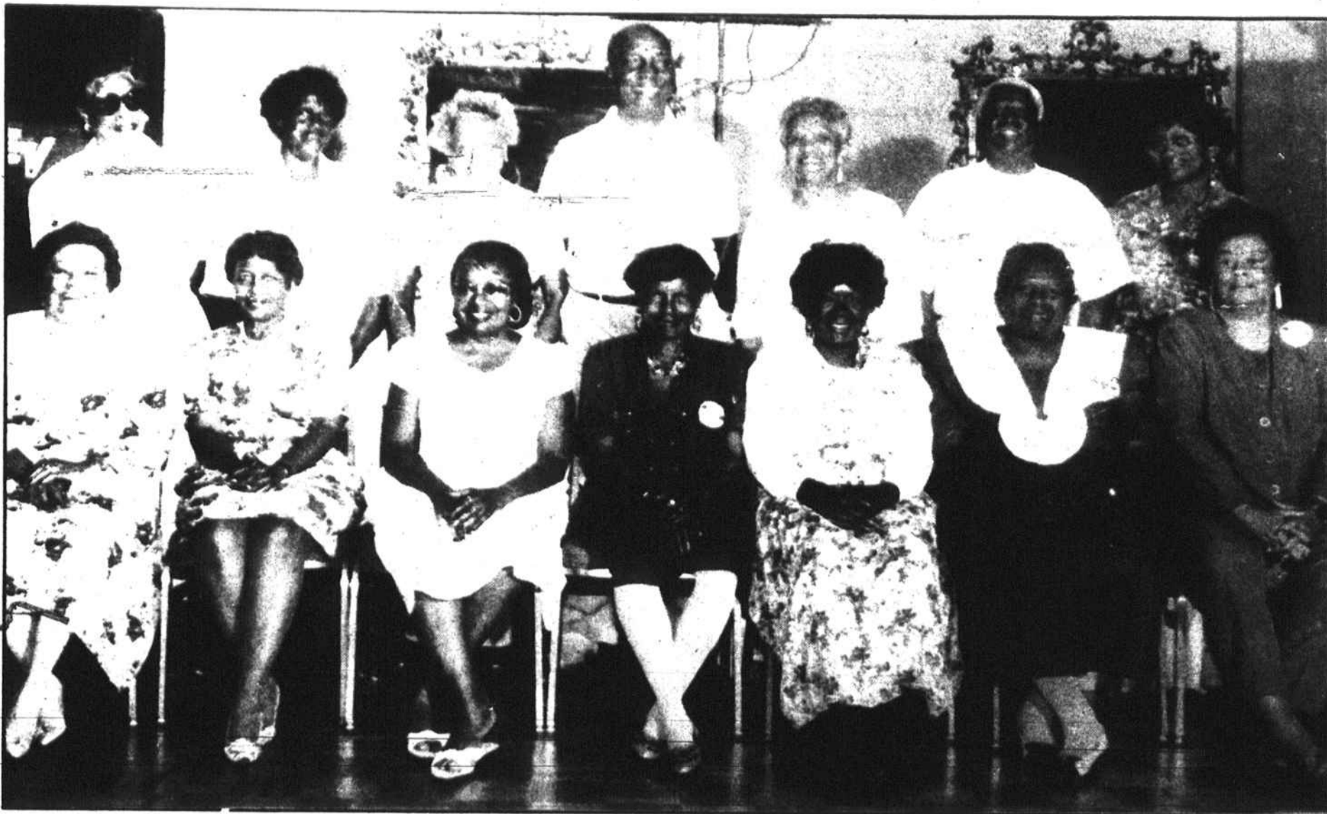
The Atkins High School mid-term Class of 1943