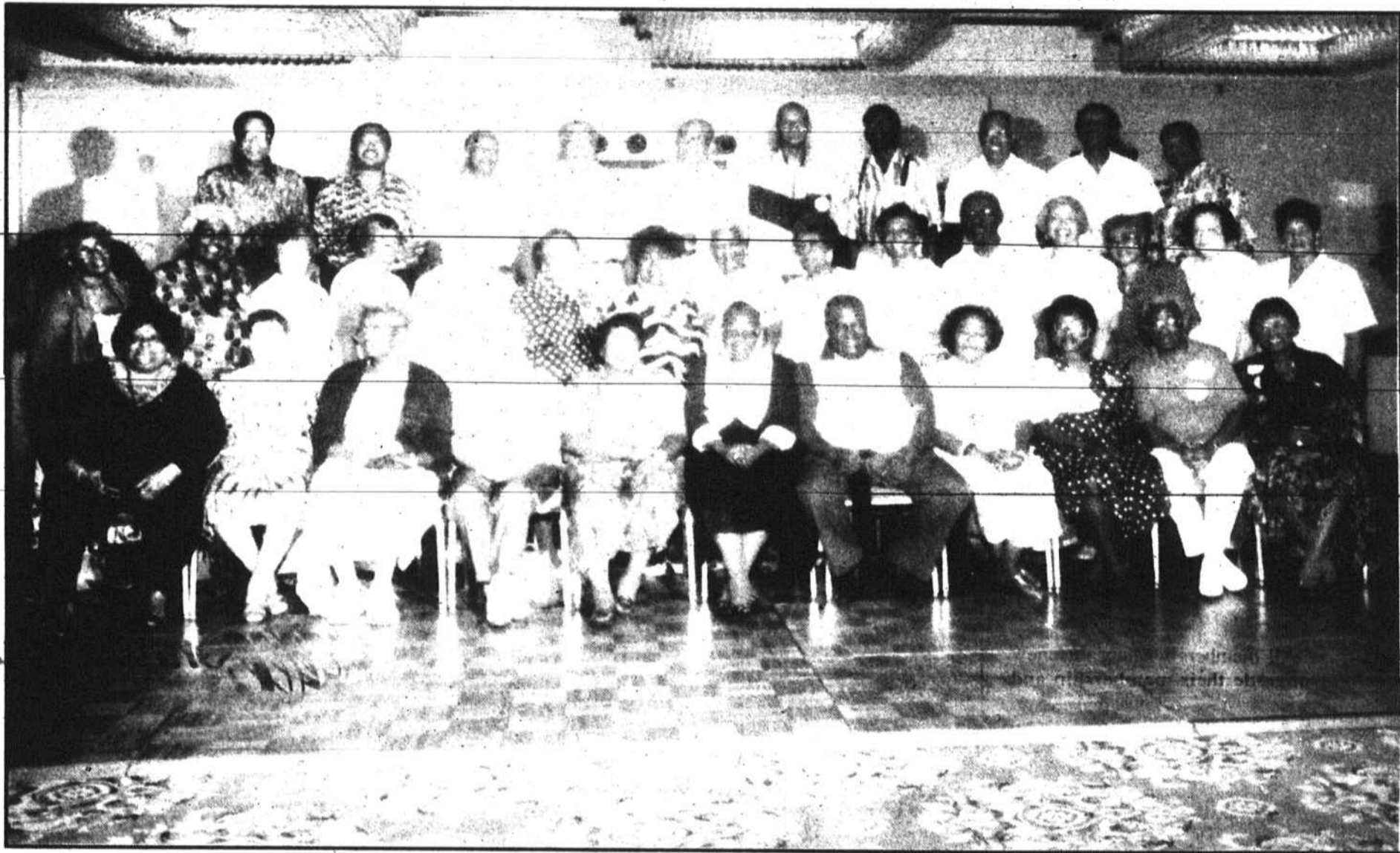
The Atkins High School June Class of 1943