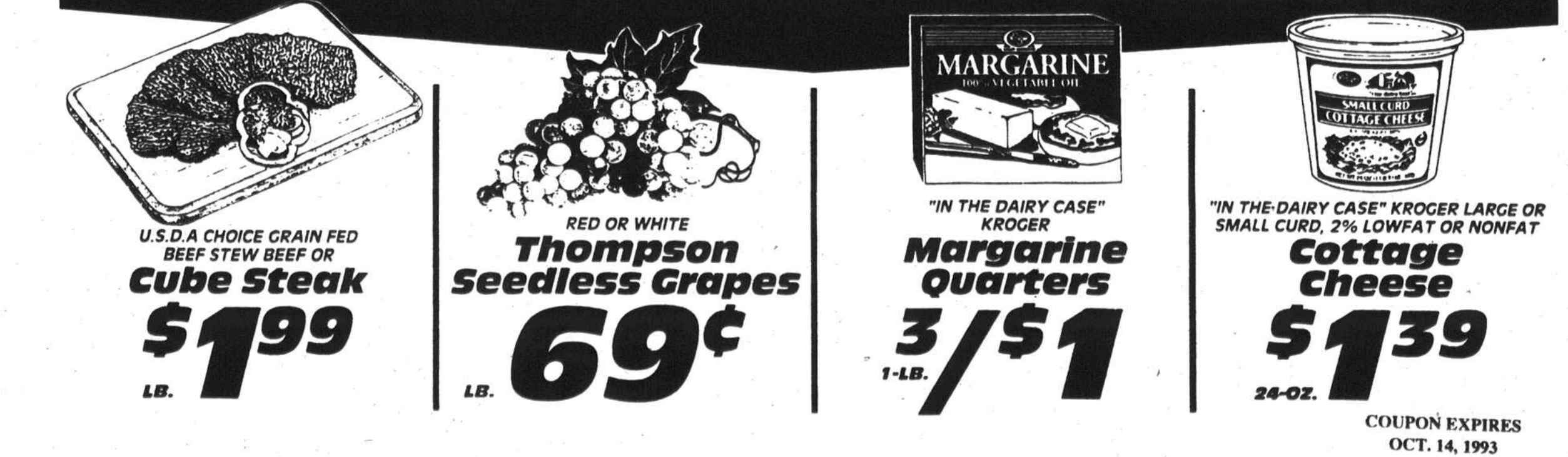
PLUS, THE SPECIALS BELOW ARE GOOD ALL WEEK LONG ...