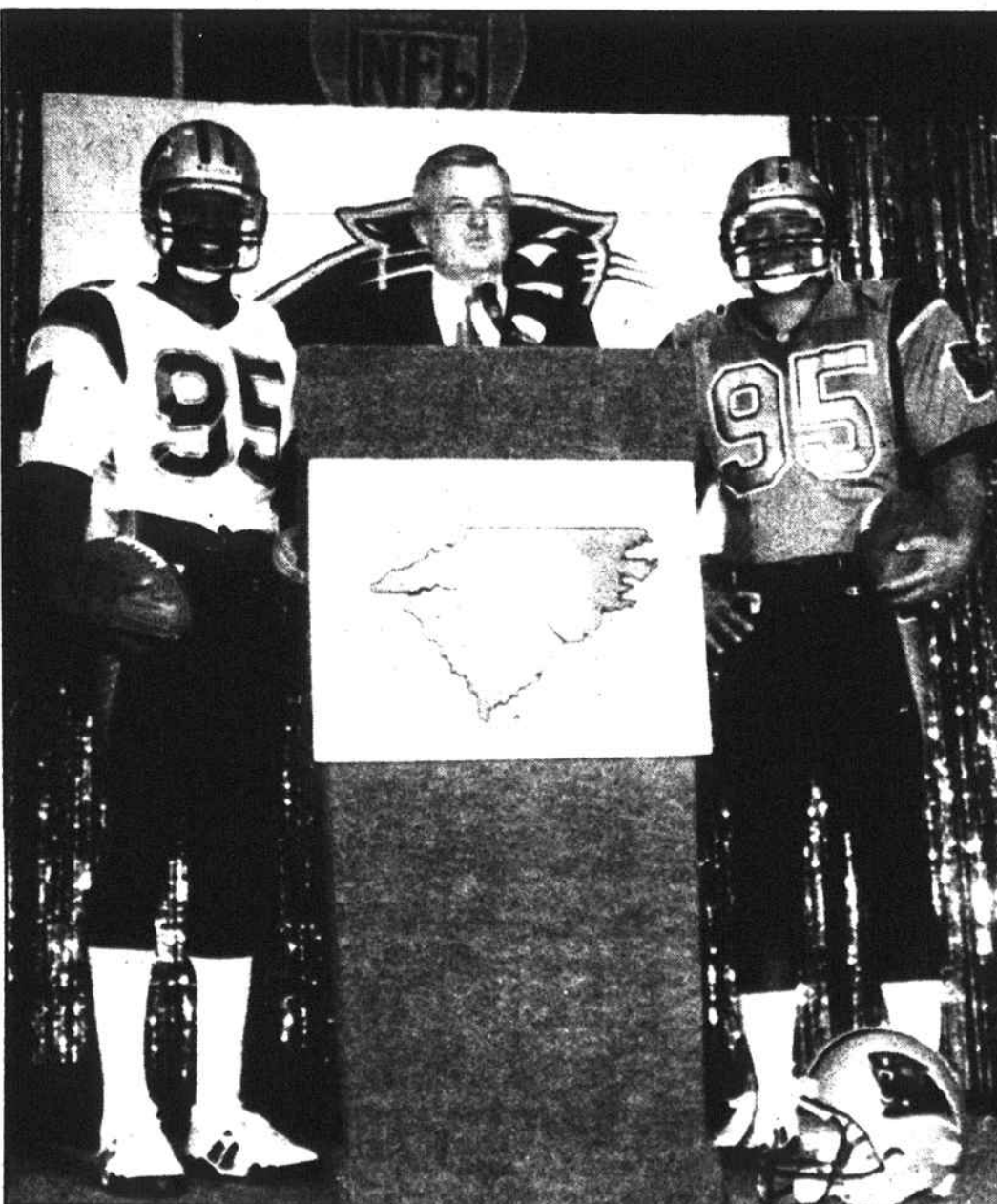
Carolina Panthers owner Jerry Richardson is surrounded by models wearing the new Panther Home and away uniforms for the NFL expansion team during a news conference in Charlotte, N.C.