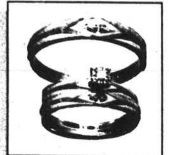
SPARKLING TRIO SETS