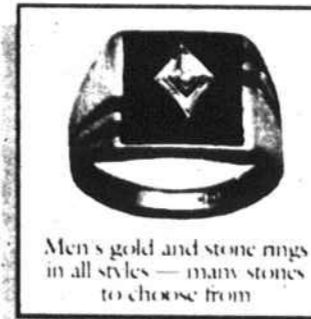
Men's gold and stone rings in all styles — many stones to choose from

Please stop in today and select the gift that lasts a lifetime.