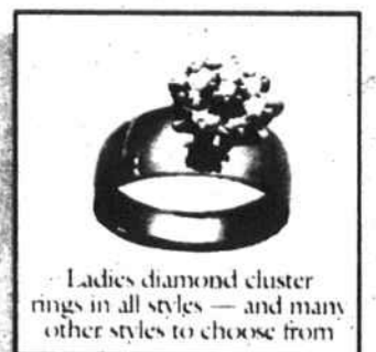
Ladies diamond cluster rings in all styles — and many other styles to choose from

FREE SIZING During our grand opening celebration