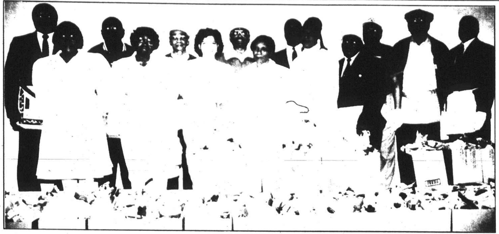
Prince Hall Masons and Eastern Stars give baskets.