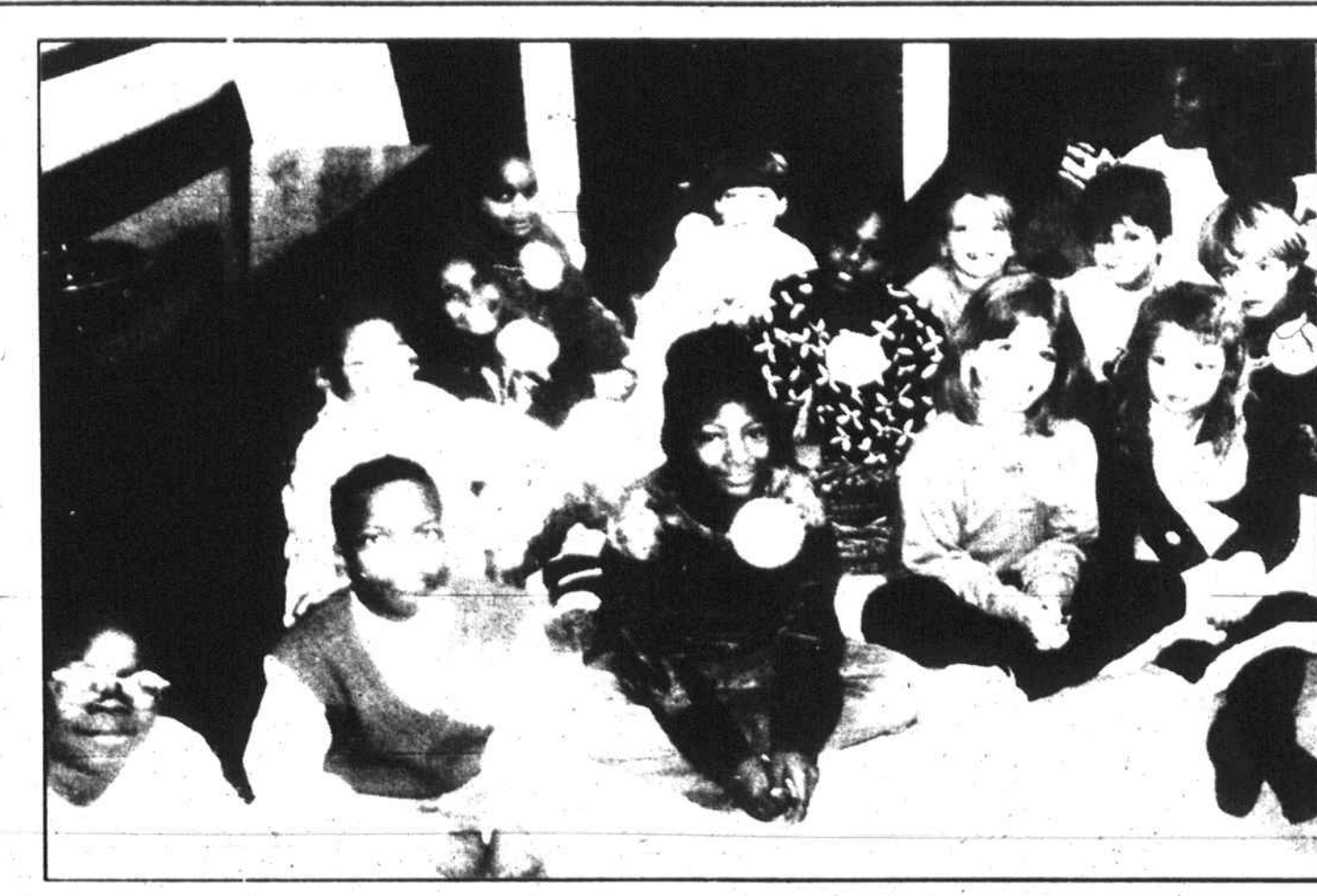
Also Mineral Springs third-graders wait outside Mayor Martha Wood's office last week to present a book they comvio- piled on ways to stop violence.

book held a poem and a drawing by one of the students. The drawings were marked with the familiar red circle with the slash across the middle that has become the universal sign of warning.