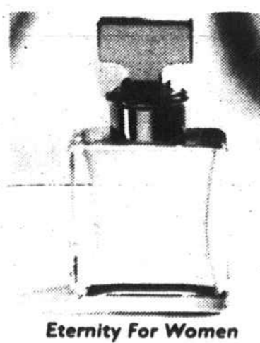
Eternity For Women