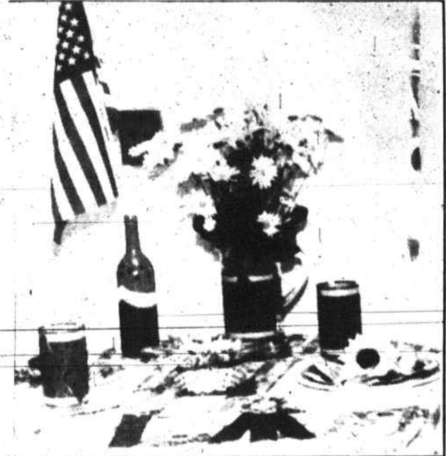
Festive Fourth table setting - winner of "Creativity Award"