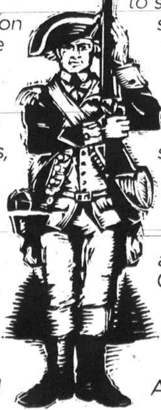
Colonial Williamsburg is as big a blast today as it was in 1776.

driving from one destination to the next. Let's go to The Virginia Waterfront. Day 1. Let's start your vacation with one of America's favorites: Colonial Williamsburg. The homes, the stores, the taverns and the Governor's Palace are exactly the way Thomas Jefferson, Patrick Henry and George Washington left them. Enjoy. Day 2. Just one hour from Williamsburg is the world's longest beach resort: Virginia Beach. If you're a beach lover, you could spend a month here surfing, jet skiing, deep-sea fishing,