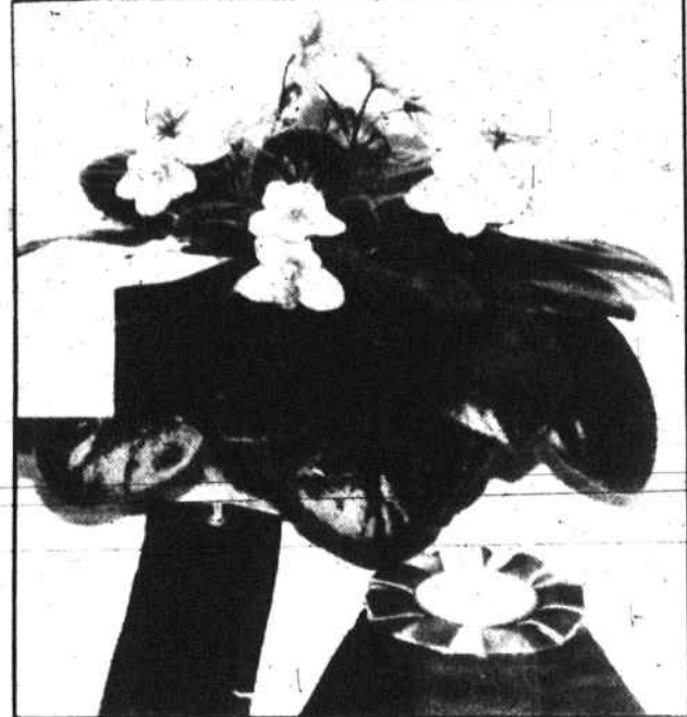
African Violet - winner of "Excellence in Horticulture Award"