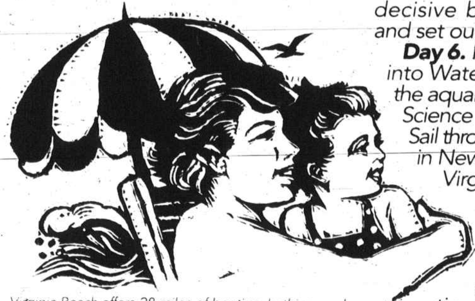
Virginia Beach offers 28 miles of boating, bathing, and biking down the boardwalk.

shopping and soaking up rays. Day 3. But you don't want to miss all the good times in Norfolk. You want to lose yourself in the virtual reality of Nauticus, the amazing new National Maritime Center. You want to gaze with awe at the biggest ships in the world. You want to see the art of the re-nowned Chrysler Museum. You want to stuff yourself full of fresh sea-