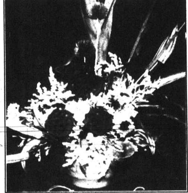
Copper Glow - Winner of "Award of Distinction"