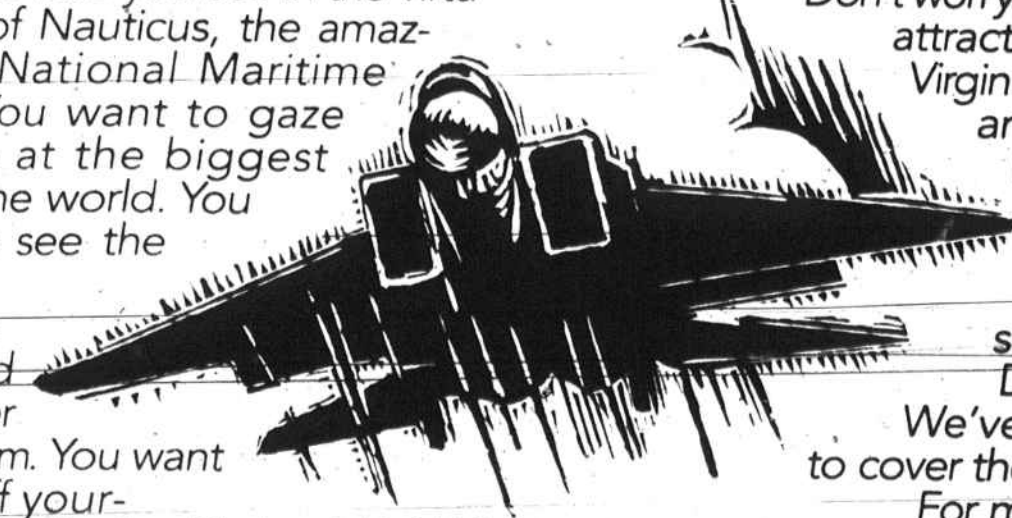
What's new in Norfolk? Nauticus, where any civilian can feel the thrill of victory without the agony of basic training.

shopping and soaking up rays. Day 3. But you don't want to miss all the good times in Norfolk. You want to lose yourself in the virtual reality of Nauticus, the amazing new National Maritime Center. You want to gaze with awe at the biggest ships in the world. You want to see the art of the re-nowned Chrysler Museum. You want to stuff yourself full of fresh sea-