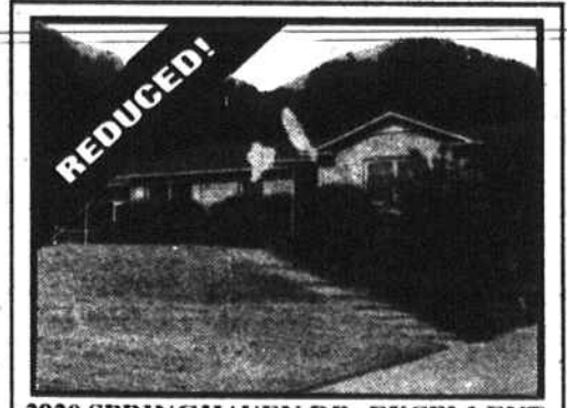
2920 SPRINGHAVEN DR.-EXCELLENT CONDITION!—3BR, 3 1/2BA, finished playroom in basement. Truly a great house w/lots of room & a beautifully landscaped yard, screened porch & deck.