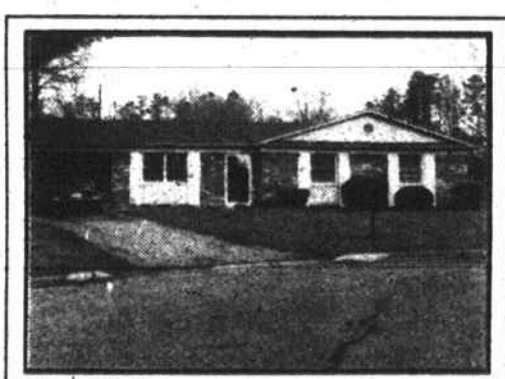
CRÉEKWAY COURT-BRICK RANCHER—Great Country Club location, 3BR, 2BA, priced to sell, perfect for family living.