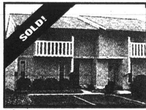
2474 TANTELON PLACE—4BR/3BA condo w/2,300 sq. ft. on 18th hole. Hdwd. floor, full finished bsmt. and pool & tennis courts give this condo everything you could want. Great price.