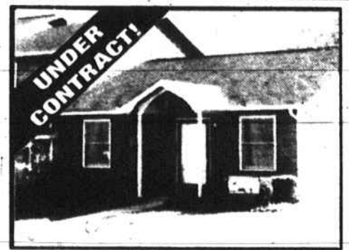
501 ROCKCLIFF COURT-EXCELLENT LOCATION —2BR townhome, beautiful decor, deco. with flair, cus. treatments. Patio w/ privacy, won't last long. Owner/Agent.