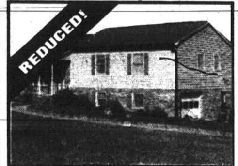
3767 DAY ROAD-WALKERTOWN DELIGHT!!!—3BR split level on a large lot. Spacious living area w/ plenty of room for a family. Bsmt gar., finished bsmt playroom, and a beautiful view off back deck.