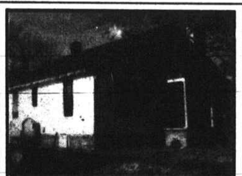
2104 FRANCIS ST.-FORECLOSURE!—Completely redecorated cottage, 2BR, 1 bath, dining alcoye Priced to sell