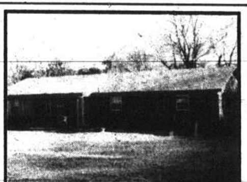
1420 FAIRCREST-GREAT LOCATION, WELL MAINTAINED BRICK RANCHER—Convenient location to Sara Lee, Wal-Mart and North Point. Excellent storage.