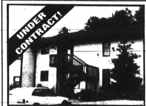
143 SOUTHRIDGE-EXCELLENT CONDITION! — Updates include new heat pump, wallpaper & carpet. This condo is priced below tax value! 2BR, 2BA, deck w/view.