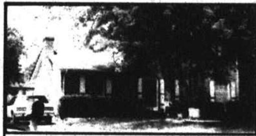
Bull Run, Stonewall—3BR, 1 1/2BA, 1 1/2 Sty., 7 rooms, FDR, fam. rm. w/FPL, gas heat, great family neighborhood. $60's. Call Phillip