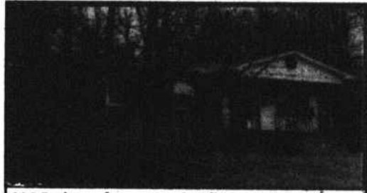
395 Parkwood Ave. (North Hills)—3BR, 1 1/2 BA, gas heat, large rooms, private rear yard, special financing. Call Ruthie. $40,000's