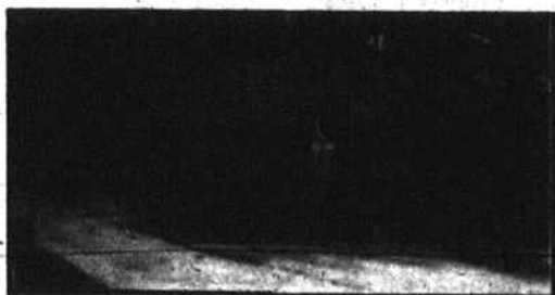
1536 Benbow (off Polo Rd.)—3BR, 2BA, brick, lg. fam. rm., country kit., recent carpet, CA, quiet street. Speas/Mt. Tabor schools. $60's. Call Carolyn.