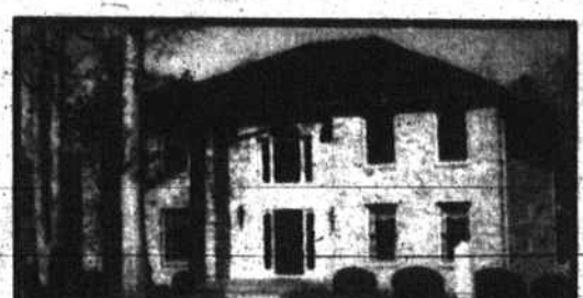
Huntington Woods—4BR, 2.5BA, 2fpls., spacious, 2 sty. foyer, almost 2900 sq.ft. + bsmt., banquet size din., gas heat, 2 car garage. $199,900.00 Call Carolyn