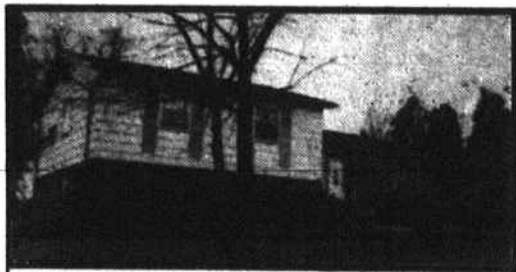
1450 East 11th Street—4BR, 1 1/2BA, lg. kit., bsmt., fam. rm., CA, heat pump, recent carpet, large fenced yard, carport. Call Richard. $70's