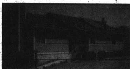
Cricket Lane—3BR, 2 full BA, one lev., L-shaped LR, din., fpl., great room sizes, super closets and storage, full bsmt, fam. rm., Call Richard. $89,900