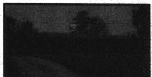
Spaulding Drive—3BR, brick, one lev., fam. rm., & bsmt. play rm., 3fpls, sunrm., 3 carports, central air, CA 2600+sq. ft. Call Carolyn to view.