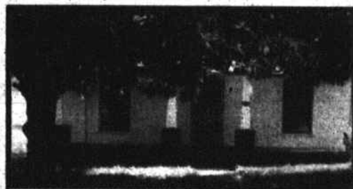
410 Ross—2BR cottage, renovated, expansion room in attic. Call Tannon to view. $30's