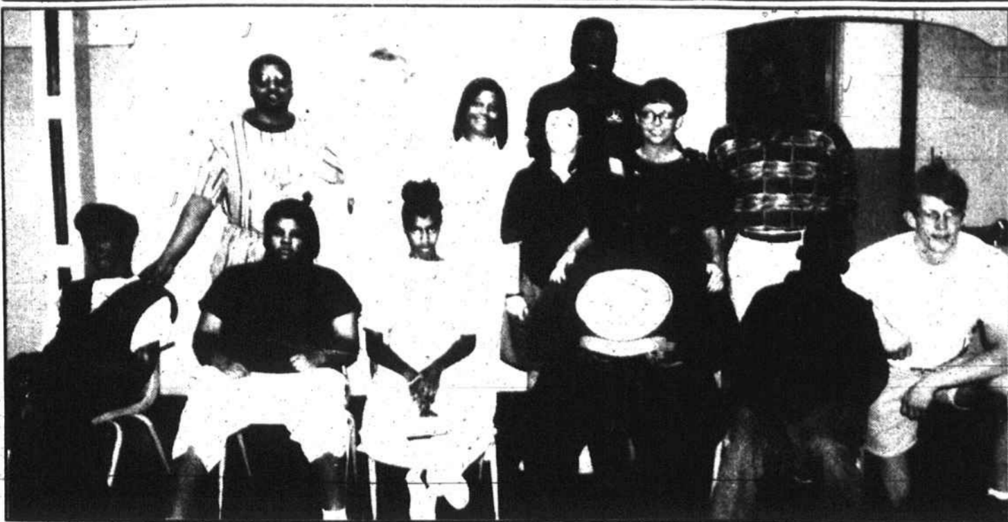
PASS program is designed to keep students in the classroom and off of the streets.