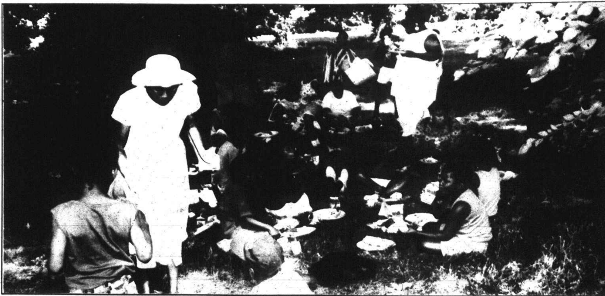
More than 200 students and their families, teachers and representatives from community organization attended a reception and picnic Saturday at Civic Park. The picnic followed a recognition ceremony for participants in the RJR/HAWS after-school tutorial program.

Community organization that have been involved this first year include: the Winston-Salem/Forsyth County Schools, the Salvation Army Boys' and Girls' Clubs, Scouts, Forsyth County Health Department, N.C. Agricultural Extension Agency, Winston-Salem Parks and Recreation and a number of churches. The recognition event and celebration was held in Anderson Center on Winston-Salem State