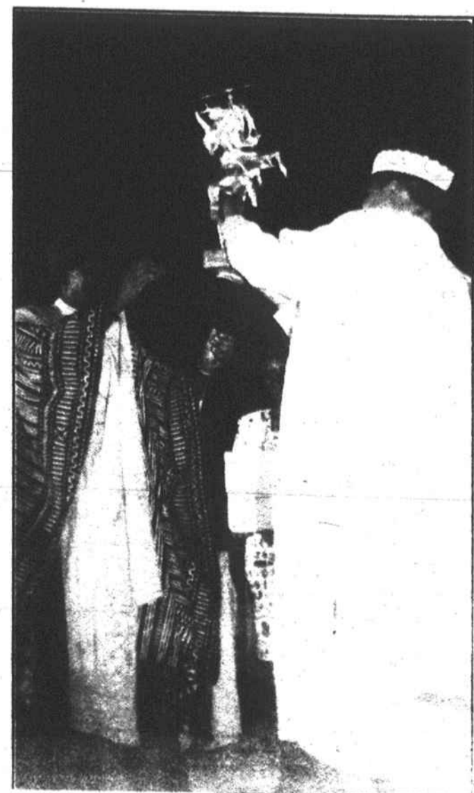
Cheick Oumar Sissoko receives the Etalon from President Compaore.