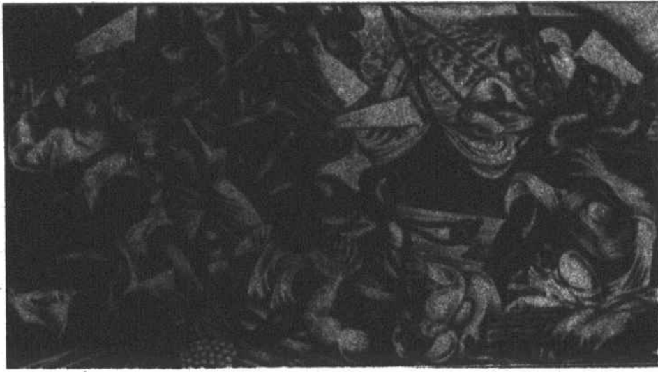
Hale Woodruff's "The Mutiny Aboard the Amistad" depicts the violent struggle of the slaves to regain their freedom.

The Harlem Renaissance was a movement during the 1920s that reflected the century's first period of "intense activity" by Black Americans in