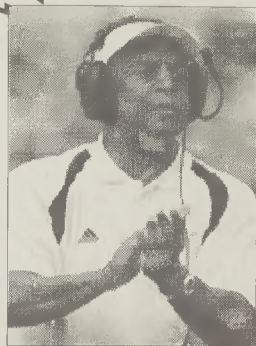
All Pro Photography