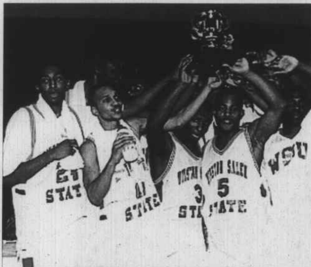
The Winston-Salem State players celebrate winning the championship of the "Bighouse" Gaines Classic.