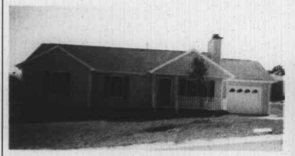
Lot 32 Neil Place 1110 Knox St. Ext. Covenant with One Car Garage $105,900 1250 Square Feet 1 Story, 3 Bedrooms, 2 Baths, 1 Car Garage

Come see Kelly A. Trexler to get pre-qualified for a new home