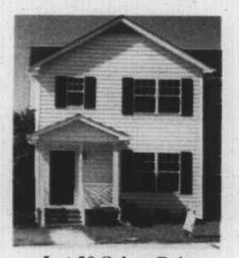
Lot 30 Salem Pointe 853 Salem Pointe Ln. Delta $74,900 1150 Square Feet 3 Bedrooms, 1 1/2 Baths

*** In any of the above listed houses, we will include all the appliances if the house closes by December 31, 2001 For more information call: (336) 273-9066