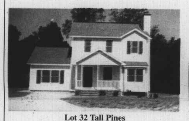
850 Shalimar Dr. Fortress with 1 Car Garage finished as Den $116,900 1442 Square Feet 3 Bedroom, 1 1/2 Baths, Living Room, Dining Room and 1 Car Garage finished as a Den