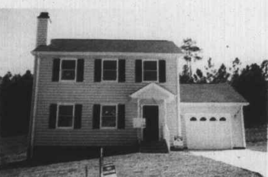
Lot 26 Tall Pines 869 Shalimar Dr. Oakmont without Den with 1 Car Garage $119,900 1475 Square Feet 2 Story, 3 Bedrooms, 2 1/2 Baths, 1 Car Garage