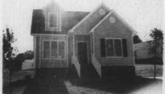
Lot 39 Neil Place 1356 Tyndall St. Sanibel $95,900 1294 Square Feet 2 Story, 3 Bedrooms with Master downstairs, 2 Baths