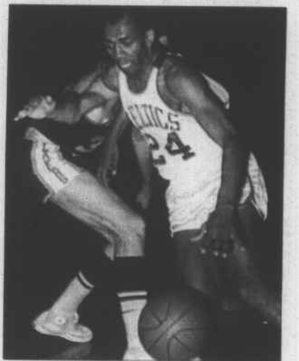
Sam Jones played his college basketball at NCCU and went on to become a Hall of Fame inductee after an illustrious career with the Celtics.