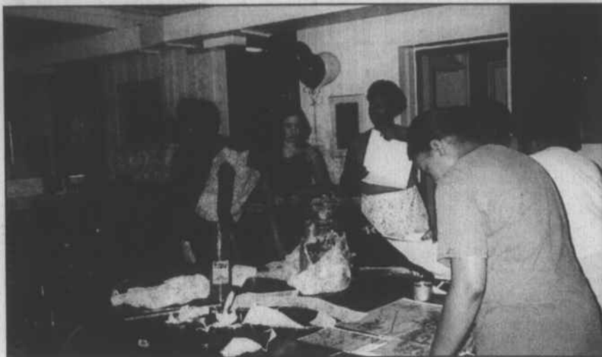
Top Teens and guests sample international foods.