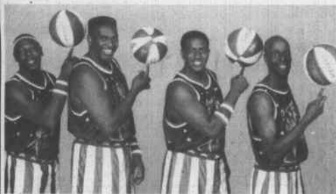
The Harlem Globetrotters bring their own brand of zany basketball to the LJV Coliseum on March 24.

For more information about the new GIS website, contact the City's Information Systems Department at 727-2846.