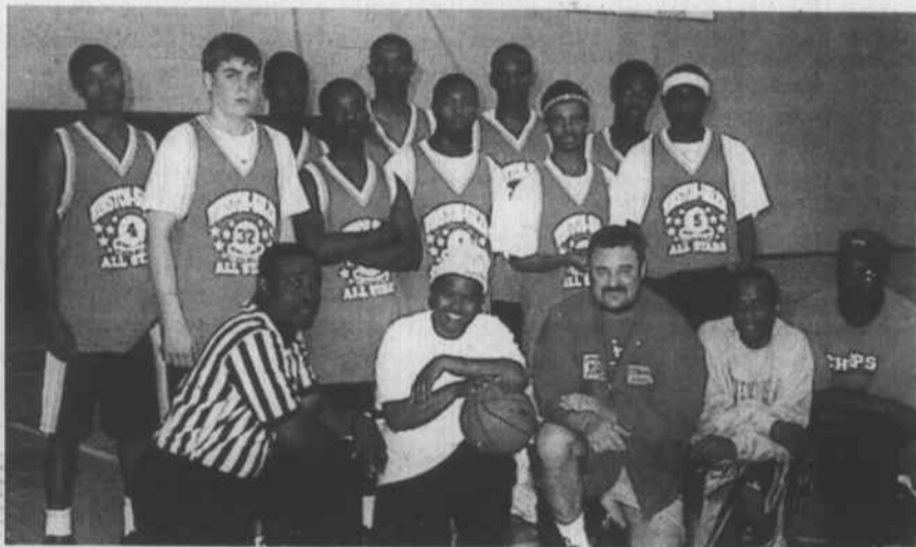
Hanes Hosiery 16's All-Stars

room at intermission. However, the scrappy Washington team fought back in the second half and finally took the lead midway through and beat back Hanes Hosiery's advances in the final minutes.