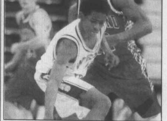
Chris Paul, of West Forsyth, who was The Chronicle's 2002 Varsity Player of the Year and 2001 JV Player of the Year, announced earlier this week that he will accept a basketball scholarship to attend Wake Forest University.