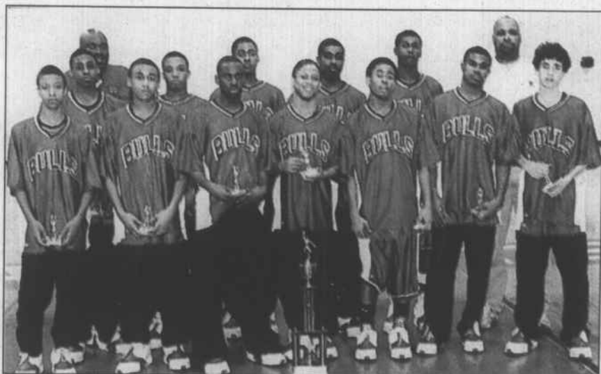
The North Carolina Bulls captured first place in the first annual GCACC Roundball Classic.