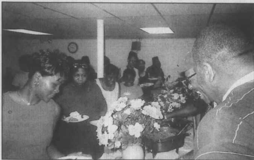
Scene from the appreciation breakfast.

been active since its inception this summer and is especially interested in mentoring the young men of the church and playing a more viable role in all ministries.