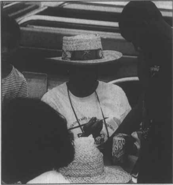
A boy gets a design put on his arm by one of the sisters from Bivouac Chapter 530.

As the snow cones brought back memories of childhoods past, the more than 250 adults reminisced, enjoying the refreshing treat in the 90+ degree heat and watched the kids compete