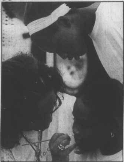
A sister from Bivouac Chapter 530 paints the face of a youngster at the event.