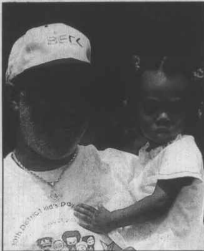
This local man brought his young daughter to the event Saturday at Rupert Bell Park.

in games, including tug of war. They were also entertained by various community groups.