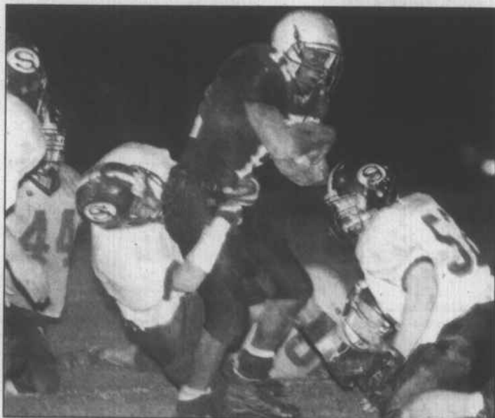
See Reynolds on B2 A Reynolds player tries to withstand being taken down.