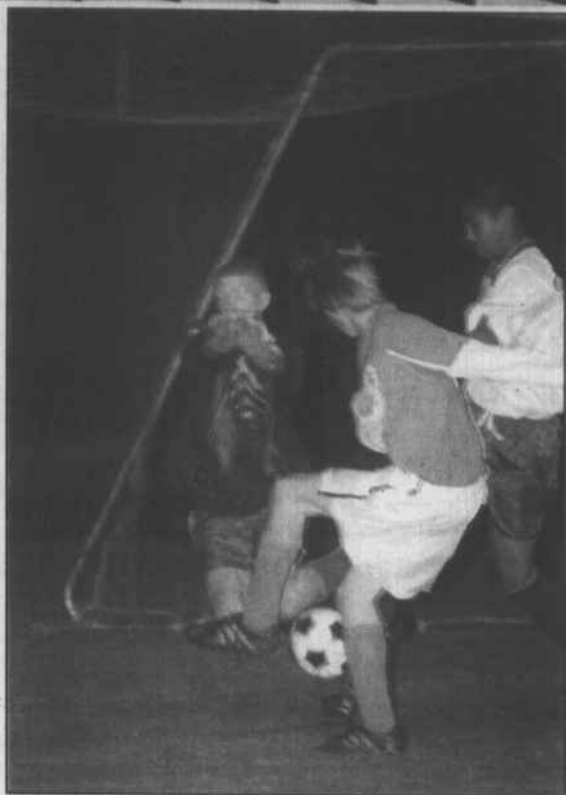
The goalie for Carver tries to stop Glenn from scoring.

The Bobcats won a play-in game against Northeast Guilford last Thursday for seeding purposes. The victory gave them the number one seed for the playoffs, which begin this week.