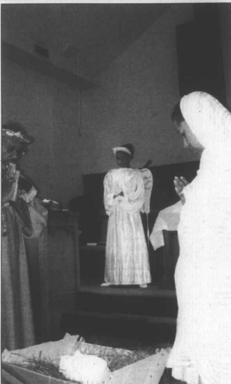
The Outdoor Live Nativity Pageant has been staged at the church for decades.

The Outdoor Live Nativity Pageant at First Baptist will be free and open to the public. The church is located at 700 North Highland Avenue.