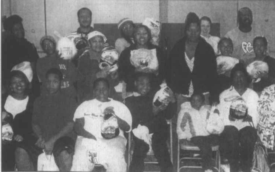
Winners pose with their birds