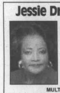
Jessie Draft & Associates LLC