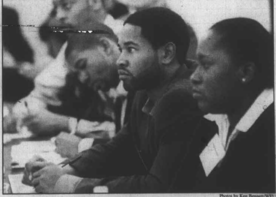
Students listen intently during the recent Consortium.