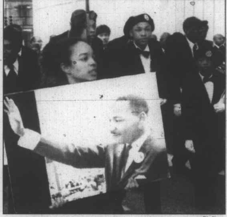
Youngsters march to the Benton Convention last year on the Martin Luther King Jr. Holiday.