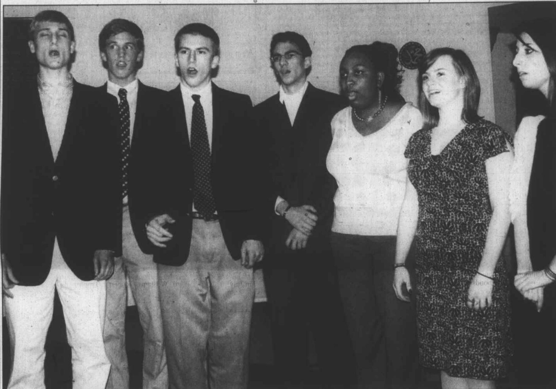
Singers from Reynolds High School bring music to the service.