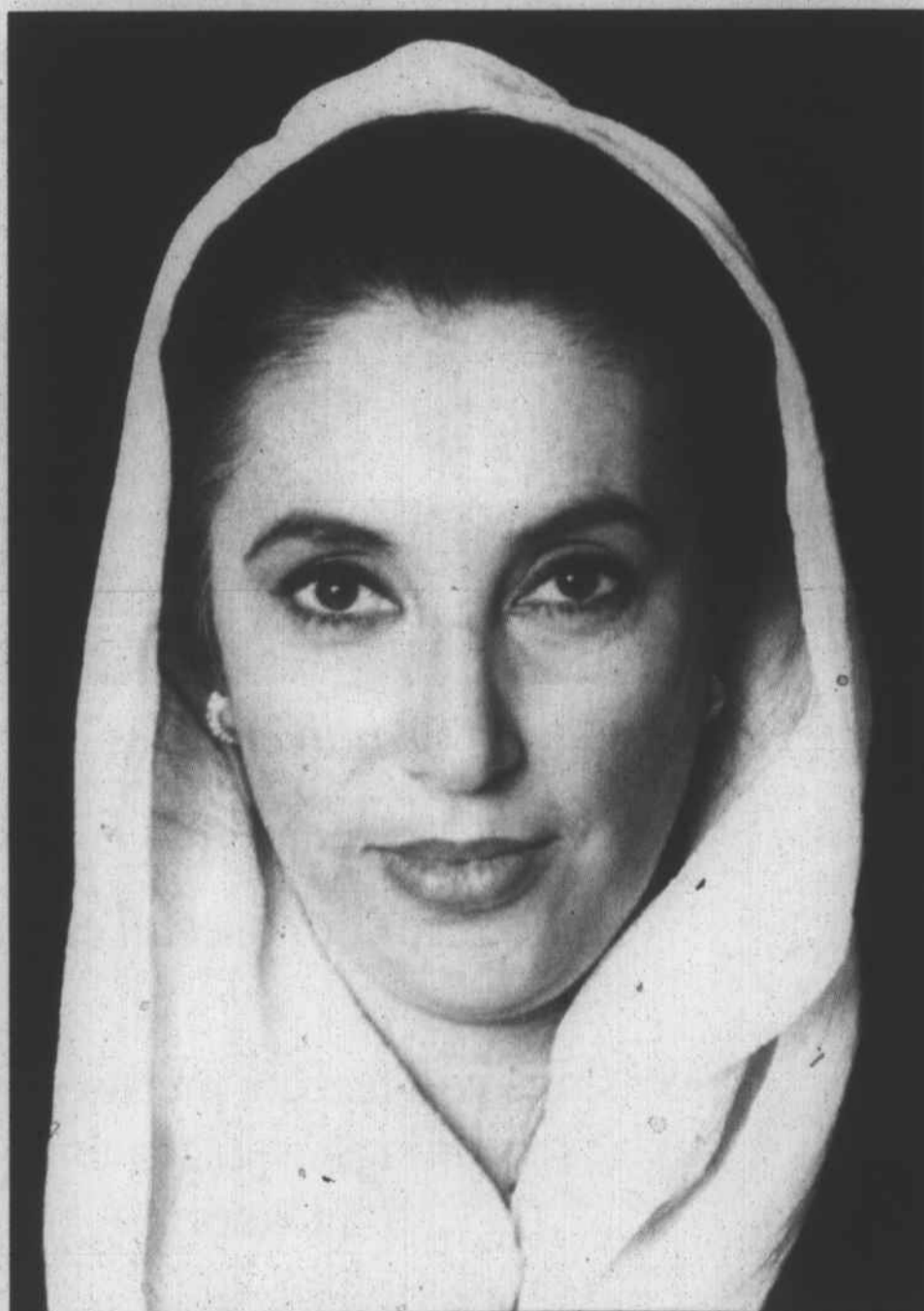
See Bhutto on B9 The late Benazir Bhutto.