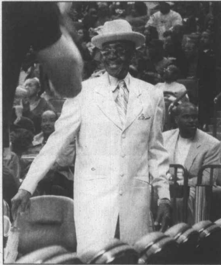
The unofficial "Mr. CIAA" shows off one of his many colorful suits during the tournament.

For more information about the CIAA conference or the 2009 Tournament to be held February 23 - 28 in Charlotte, please visit www.ciaatournament.org .