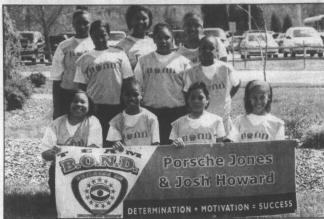
Team B.O.N.D 10-and-under squad.