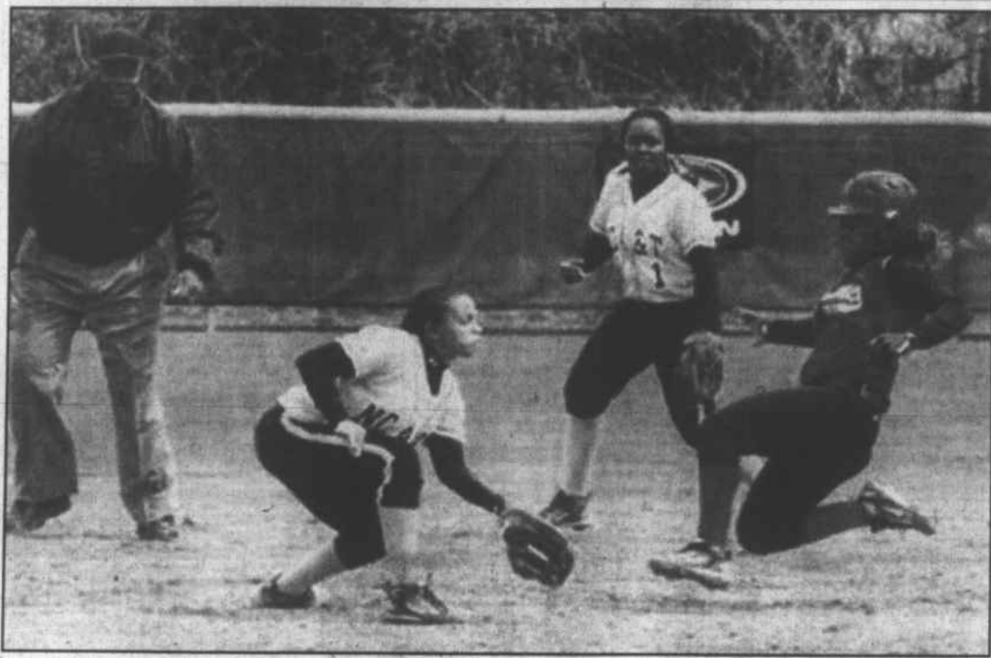
Here, a Lady Ram gets tagged out during a loss to the Lady Aggies on Monday.