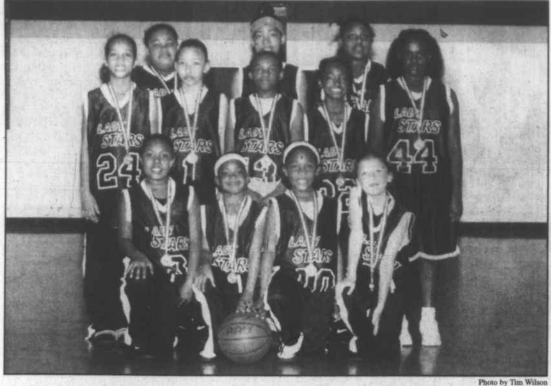
The High Point Lady Stars captured a 9U regional title over the weekend.

That was just a great game. It's rare for me to want to watch anything more than once. I don't even like to buy movies because I don't want