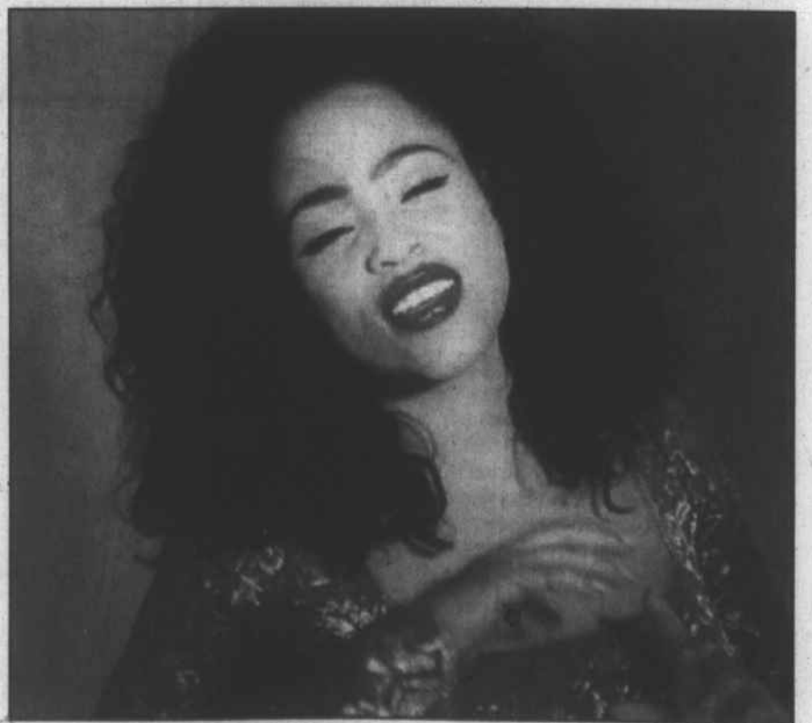
Miki Howard is known for a long string of hits.

"Private Collection" is exclusively available at her website, www.miki-howard.com, where it can be downloaded or ordered on a CD. The site also features information about upcoming tour dates.