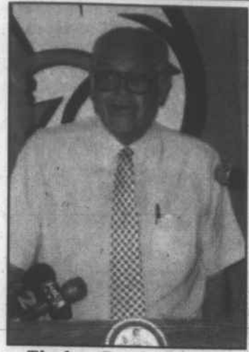
The late Coach Clarence Bighouse Gaines