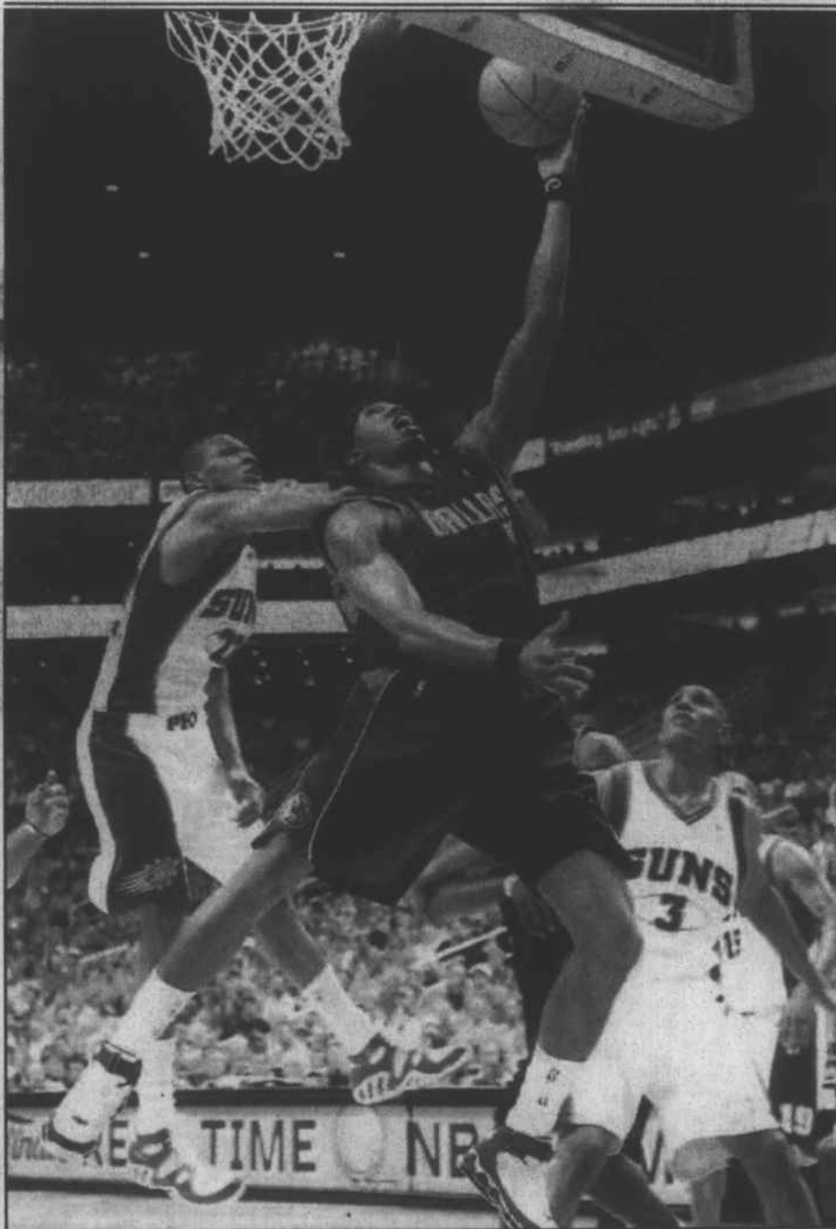
Dallas Maverick star Josh Howard received a lot of heat after his comments on smoking marijuana on a Dallas radio show last week.