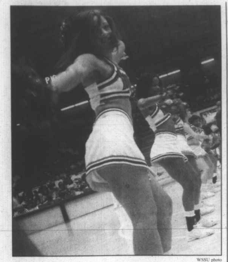
WSSU will host a cheer camp next month.