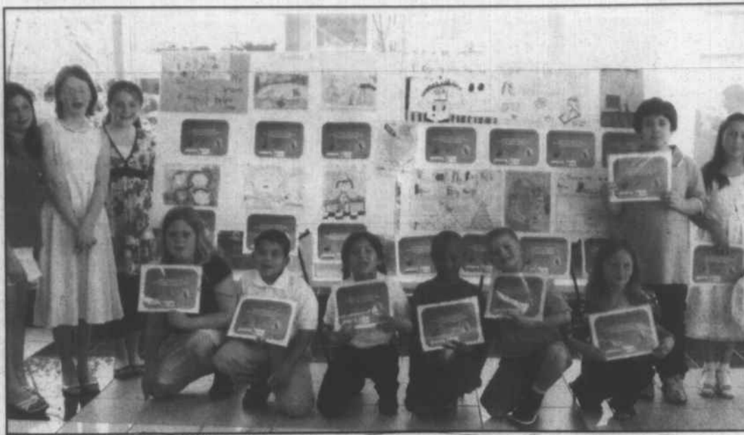
Student winners pose with their drawings.

The series of eight events this year included the first annual Brain Art Contest for students in two age groups, Kindergarten - Grade 2 and Grades 3 - 5. More than 125 entries were received from several area schools. The judges, including artists and neuroscientists, selected the top three winners in each category, along with honorable mentions. On