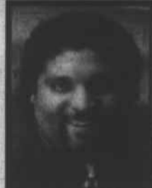
Dr. William Barber