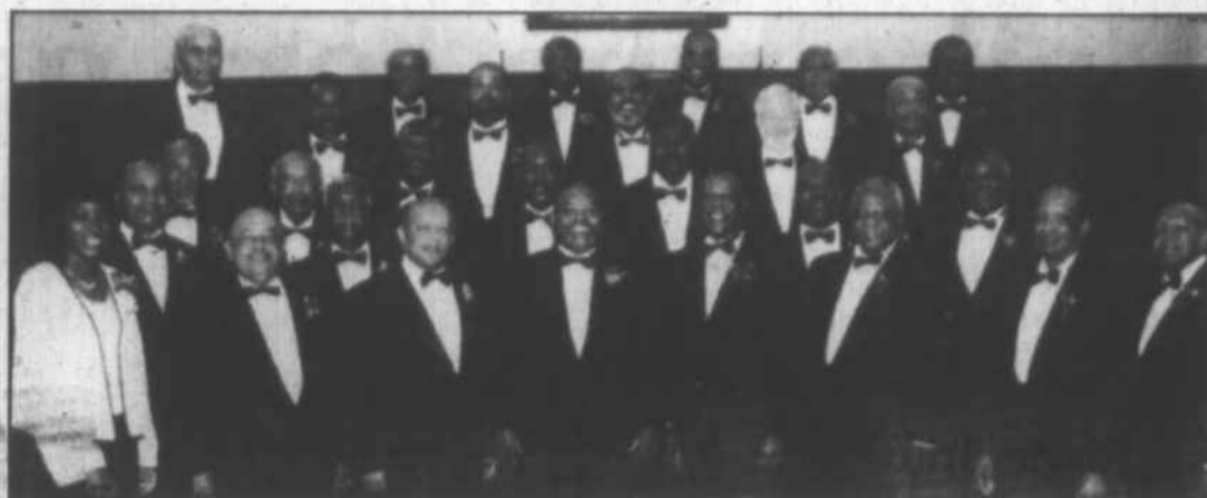
The Twin City Choristers