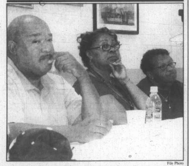
Several residents expressed their concerns about the fate of