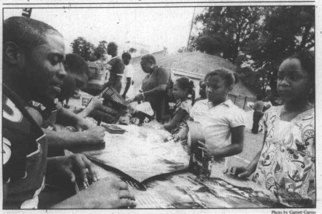
Ram football players sign autographs for young fans at Bowman Gray.

Wake Forest opens its regular season schedule on Friday at 5 p.m. (ET) against Virginia Commonwealth in the Nike Carolina Classic in Chapel Hill. The Deacs will face Florida International on Sunday at 2 p.m. (ET) on the final day of the Nike Carolina Classic