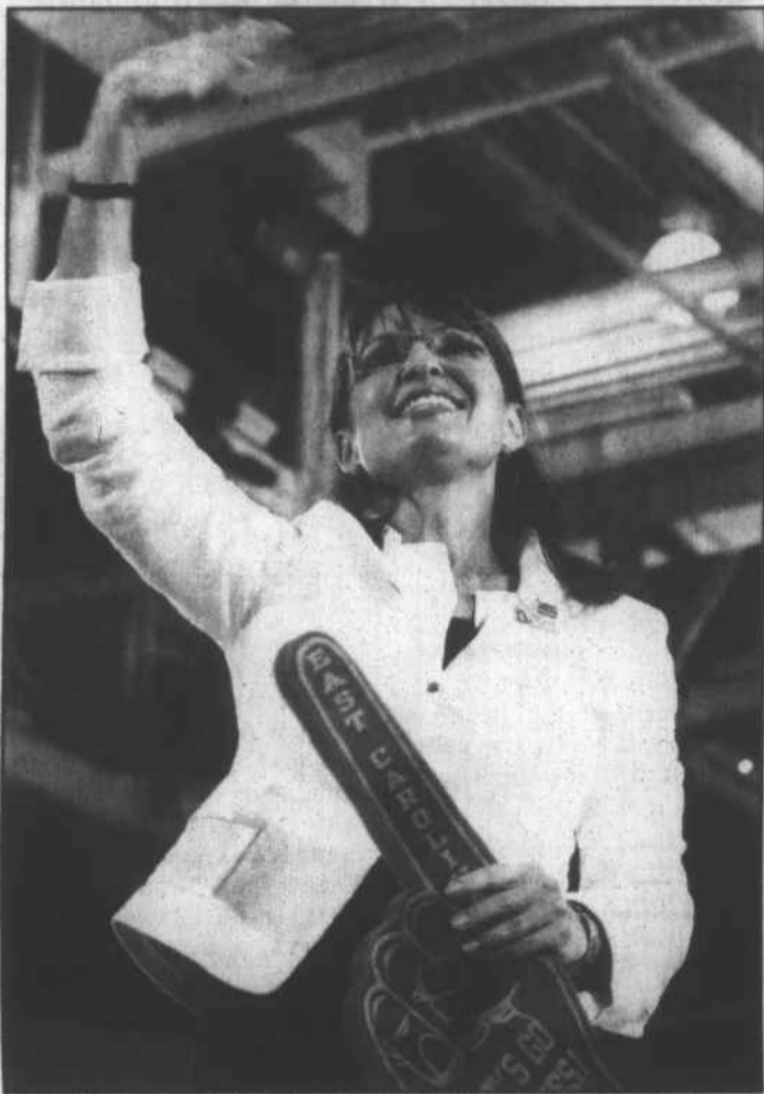
Gov. Sarah Palin at a stop in Greenville, N.C. on Tuesday.