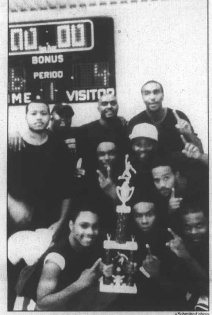
Members of the Sanitation department squad celebrate.